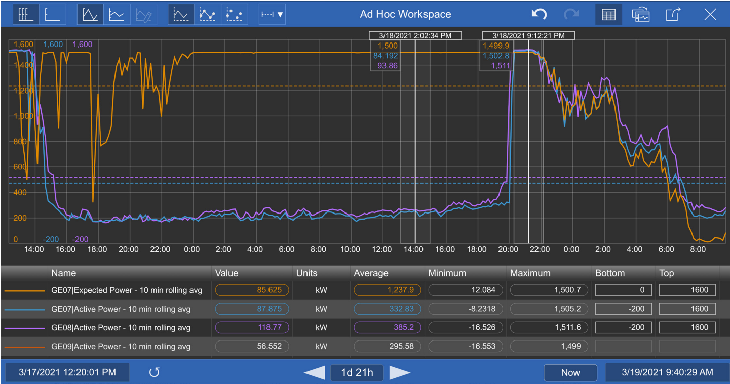
Figure 3: In the AVEVA PI Vision ad hoc workspace, this user has added 10-minute rolling averages for three assets' active power. Alongside those three, the user also added the expected power for one of them. Visualizing them altogether on the same trend, the user can conduct an ad hoc analysis to compare actual behavior to expected behavior.

Easily change scales and add average, minimum, and maximum trend lines to better understand your data. Get an overview of key values with a quick glance at the summary table. The ad hoc tools in AVEVA PI Vision make exploring your data simple.