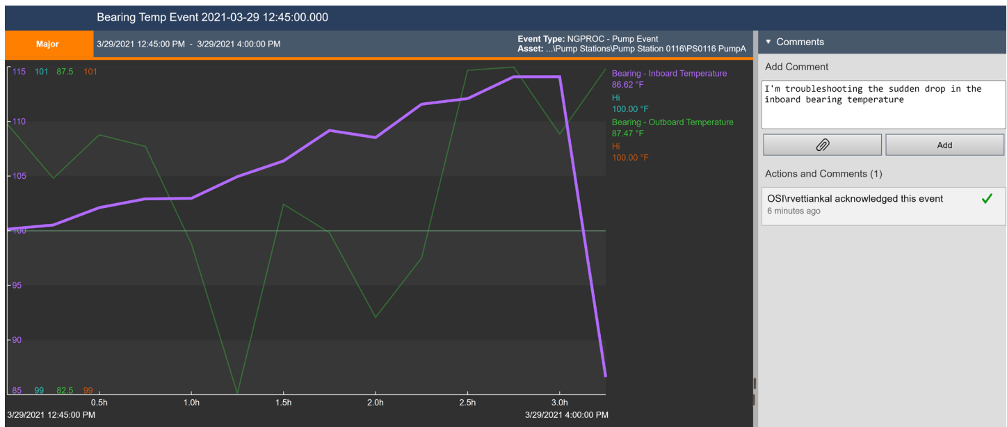
Figure 2: In this screenshot of AVEVA PI Vision event details, you can see a bearing temperature event, including trends for the attributes that make up the event. This major event (orange severity level) appears to have been triggered by a sudden drop in the inboard bearing temperature (purple trend). The user has acknowledged the event and is providing a comment, indicating to colleagues that they are troubleshooting the event.

With your analysis complete, annotate the event with your findings to promote instant collaboration and establish a standard for future responses.